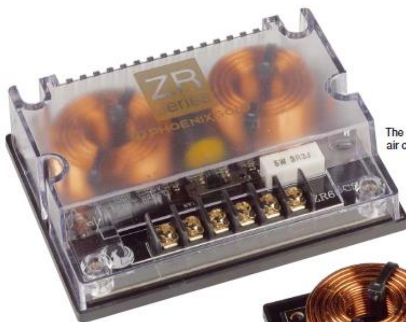
The crossover shines with two thick air core coils for low distortion

cone-shaped. It is not flared towards the edge like the bell of a trumpet but shows a straight cone profile (AWI shape) when viewed from the side, giving maximum stability but being somewhat more susceptible to resonances than the usual curved NAWI shape. The dust cap and the surround, both made of soft rubber, have a somewhat moderating effect on these cone resonances. The ZR65CS's tweeter is inconspicuous. We are dealing with a one-inch fabric dome - by far the most popular design for high-quality car audio systems.